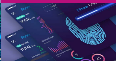
MOBILE APP DEV

EXPLORE OUR BACHELORS & DIPLOMA COURSES TODAY